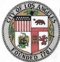
ERIC GARCETTI MAYOR

5500 Hollywood Blvd. #313 Los Angeles, CA 90028 info@hsdnc.org www.hsdnc.org